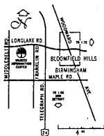
Look for the Wabeek signs on West Long Lake Rd. west of Telegraph.

Should you decide to live at Wabeek a very special way of life will be yours. Your immediate environment will include hills, valleys, lakes and trees. Leisure time activities include boating, hiking and bicycling. And property owners are eligible for membership in the Wabeek Country Club which features a superb championship golf course designed by Jack Nicklaus and Peter Dye, membership also includes tennis facilities. Wabeek is secluded yet fine shops, restaurants, cultural centers and recreation are a short drive away. Wabeek. A new way of life awaiting you.