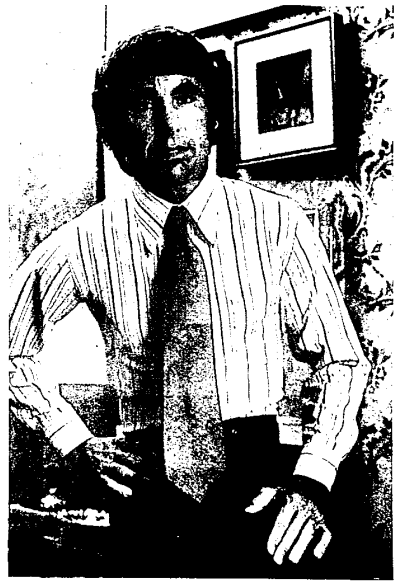
Hathaway's multi-striped oxford: multi-pleasurable. There's lots to like in these dress shirts, but then that's a Hathaway hallmark. The stripes are in marvelous color combinations: green/light blue/rust, brown/light blue/gold, blue/light green/peach — all on white grounds. The fabric's a well-behaved, permanently-pressed oxfordcloth blended of polyester/cotton. And the styling is unrepachable: spread collar (sizes 14½ to 17), single button cuffs (sleeve lengths 32 to 35). A lot to like at $16.

Police asked anyone who has information to contact them at 644-3400.