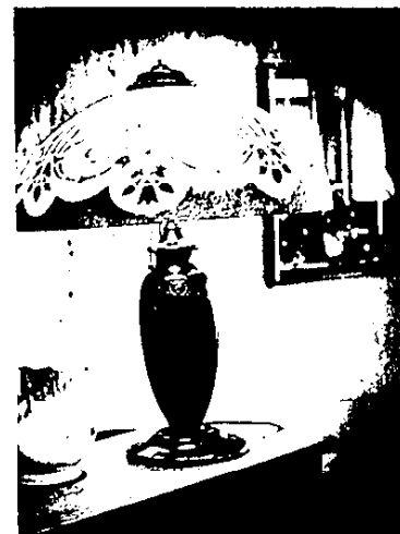
Newer nostalgia from the 30s

Also it is these precious items which add charm and interest to homes, which otherwise lack character because of the cost of building detail into our homes today.