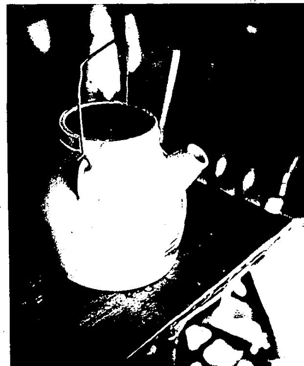
Batter pours easily from this mid-18th century jug

FROM NOW ON, DECORATING WILL NEVER BE THE SAME.