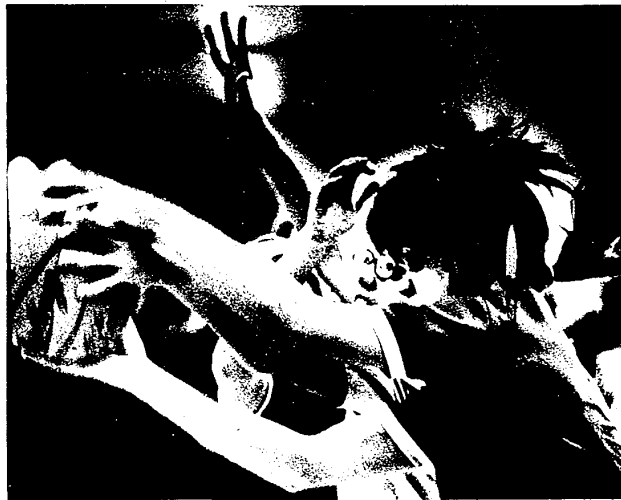
A Mercy girl (with glasses) mixes it up against Borgess

Southfield, 4-2 overall, plays next on Thursday (Oct. 24) at Birmingham Seaholm. Game time is 6 p.m.