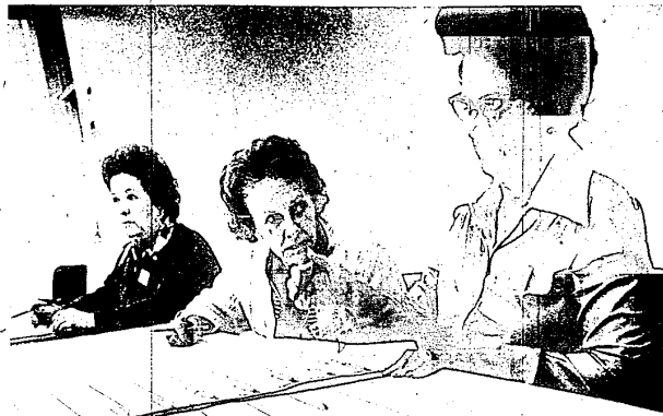
City of Farmington election workers fill in the blanks of a long ballot form on Tuesday night.