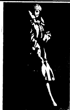
FABULOUS FITCH $2050.00

"Architecture is the most important of the arts because (See YAMASAKI, page 4)