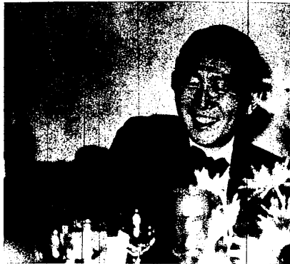
Man of the evening: Minoru Yamasaki

The society's activities are designed to appeal to all skiers, from beginners to experts, from young adults to family groups.