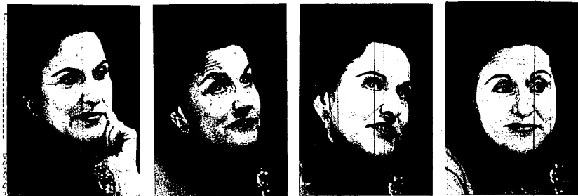
'People are much more frank about the problems they have now'—Abigail Van Buren