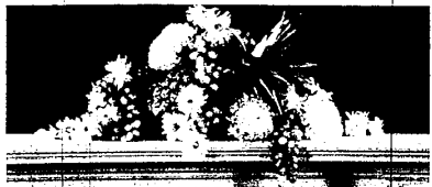
FRUIT AND FLOWERS combine for an elegant Thanksgiving mantle arrangement. Pom-pom and smaller yellow chrysanthemums complement the pineapple and graceful bunches of pale yellow grapes.