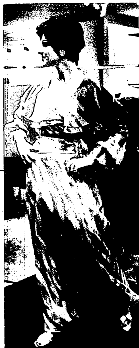
Green and pink chiffon has the flounced and fluid look of today.