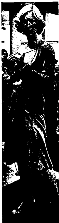
Clingy, two-piece look is news all over the world.

"YOU'LL SEE lots of shirts on shirts," Glueck said. "All are part of a dress-down, dress-up way of fashion." Fabrics were washable and fluid, and panne velvet was featured in several. Little shirt tops are designed to wear with anything. Party pajamas, the choir boy shirt, peasant blouses and embroidery are all part of today's fashion. "Black is beautiful, and the two-piece look is new all over the world," Glueck said. In all, the new clothes reflect a return to femininity, an addition to the sportswear in today's woman's wardrobes.