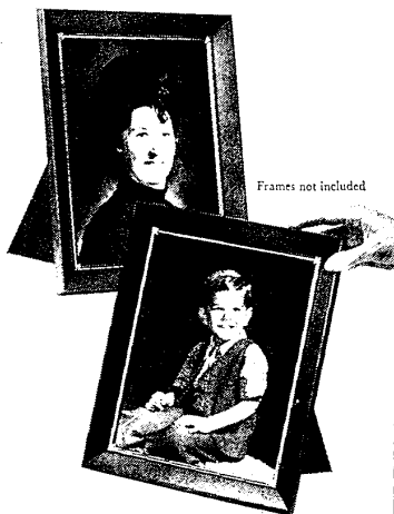
Frames not included

No appointment needed. One offer per person—two per family. $1.00 charge for each added person in groups. This photograph offer may not be combined with any other advertised offer.