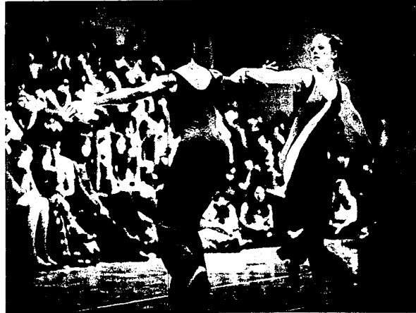
Members of the Harbringer Dance Company glide and swirl during a performance at Thompson Junior High School while in Southfield last week. The 10-member troupe, part of

Young Audiences Inc., danced their way through an hour long program designed to introduce dance to the students.