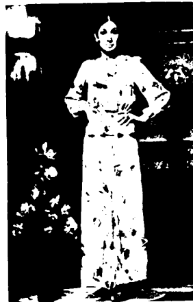
Feminine spring comes with a two piece ensemble