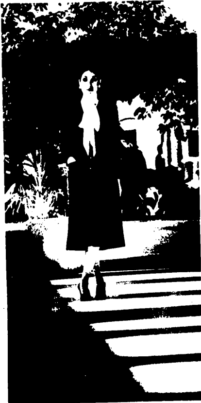
Sibley-Coffee design the go-anywhere suit for the active woman

Because they are sophisticated, well stated and not flamboyant, they are ageless and adaptable.