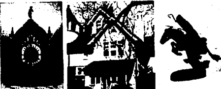
Pictured above L to R: 19th Century English Bracket Clock 22" high, The Gulbenkian Mediterranean Style Estate, Larchmont, New York; "The Cheyenne" bronze signed Frederic Remington 22" high.

of the magnificent Gulbenkian Collection At our Galleries February 7 & 8 and 9