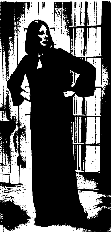
Chiffon and matte jersey team up for simplicity at night