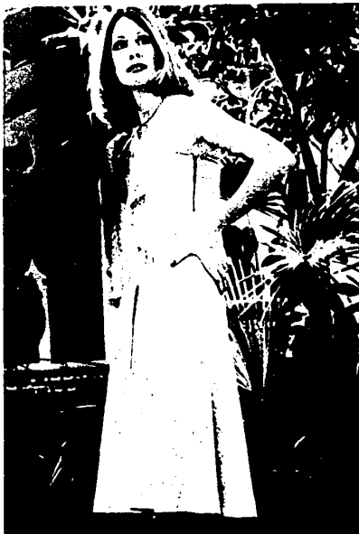
Noriko's strapless sundress in red and white cotton knit

striped strapless sundresses and billowy, raglan sleeved chemises to simple tunic-like tops with drawstring waists to top any part, the cotton knits are practical and feminine. Noriko plays with lots of colors for spring, from bright emerald green and chrome yellow combinations to more subtle matches of yellow, white and brown. Other solids such as mat-tisse blue, white, red, yellow and browns make the collection colorful and fresh.