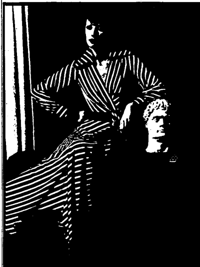
Second at Lippincott Dennis Somerset Mall, Big Beaver at Coolidge Tric