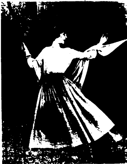
Geoffrey Beene transforms raw silk into the season's most unusual big skirt.