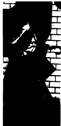
Gabardine wraps up rainy spring days.

By CHRISTINE WALDEN If you're already bored with Spring '75, take a look at the Geoffrey Beene collection and you'll find clothes you can't live without, almost.