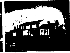
CAPTIVATING COLONIAL IN BLOOMFIELD VILLAGE — Sensational 4 bedrooms, 3 1/2 bath home plus maid's quarters. Huge family room that makes entertaining a pleasure. Separate library. Ultra modern kitchen with all conveniences. First floor laundry room. Patio off family room and breakfast room. Beautifully finished recreation room with dark room and storage.

It's got personality plus! Ranch with 3 bedrooms, 2 1/2 baths on a beautiful setting. Open floor plan with picture windows overlooking a spectacular wooded ravine. Modern kitchen with all appliances. Library. Heated pool with separate cabana house and large workshop.