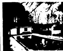
OPEN SUNDAY 2-5 7448 FRANKLIN COURT — FRANKLIN VILLAGE (Franklin Rd. to Fourteen Mile, turn right on Franklin Ct.)

Perfect time to buy these contemporary condominiums at drastically slashed prices. Two or three bedrooms — Dramatic living with balconies overlooking the gorgeous wooded setting. Walk to quaint Franklin Village — Builder will finish all units, priced from $98,000 complete with everything.