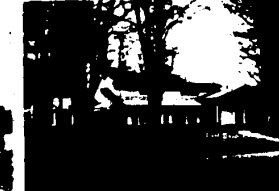
SOUTHFIELD — DRAMATICALLY DIFFERENT — Marble foyer with a suspended circular stairway. Super colonial with a first floor Master bedroom suite plus four bedrooms, two baths on second floor. Oak paneled family room perfect for entertaining with wet bar, fireplace and outdoor patio. Paneled library with built-ins. Dream kitchen. Two powder rooms. Two gas forced air furnaces and central air conditioning.