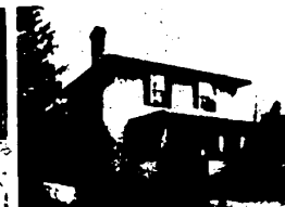
BIRMINGHAM — SAVE GAS — Walk to town, be in the center of things. Artistic older home with three bedrooms, 1 1/2 baths. Sun room, full basement. Garage. Priced at $38,500. Must be sold.