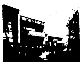
OPEN SATURDAY AND SUNDAY 2-5 VILLAGE RAVINE CONDOMINIUMS (Center of Franklin Village — Private Dr. East off Franklin Rd.)

A quality education for those who care enough