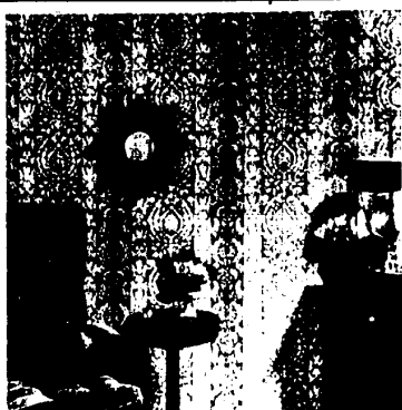
"TEMPLETON" by Strahan. Old stencil motifs, popular in Early New England homes, were the inspiration for this popular design. The use of the pineapple motif, symbolizing hospitality dates the original stencil to the late 1700's.

glass suncatchers in the Farmington Community Center with instructor Beverly Halbauer at 7:30 p.m. Registrations accepted in the center.