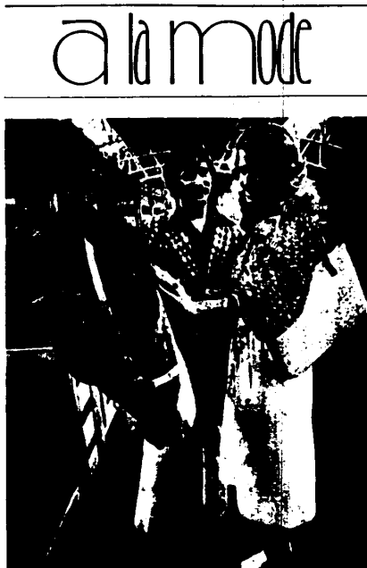
The pair teams peasant with all-American. She's in St. Laurent's flowered peasant blouse and poplin skirt. He's going bright with an Austin Reed sports coat in navy, orange and yellow, toned down with yellow pants and navy shirt.

ECHO PARK 4275 ECHO ROAD, BLOOMFIELD HILLS 646-5590