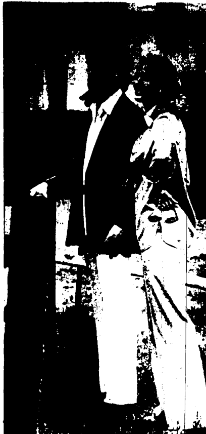
Continental and sophisticated arrives with his Lebow burgundy cashmere jacket and beige shirt, opened up and easy. She's got on Anne Klein's lime green pant suit with matching blouse, easy dressing for any spectators

Fashions, courtesy of Jacobson's, photographed at Bloomfield Open Hunt Club