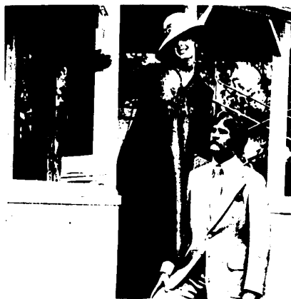
An elegant day at the horse show comes with Halston's red silk big dress. Match it with Frank Olive's white painted straw hat and simple sandals. He's wearing a Northridge bone linen suit, paired with a peach shirt, plaid tie and completed with a maroon silk scarf.