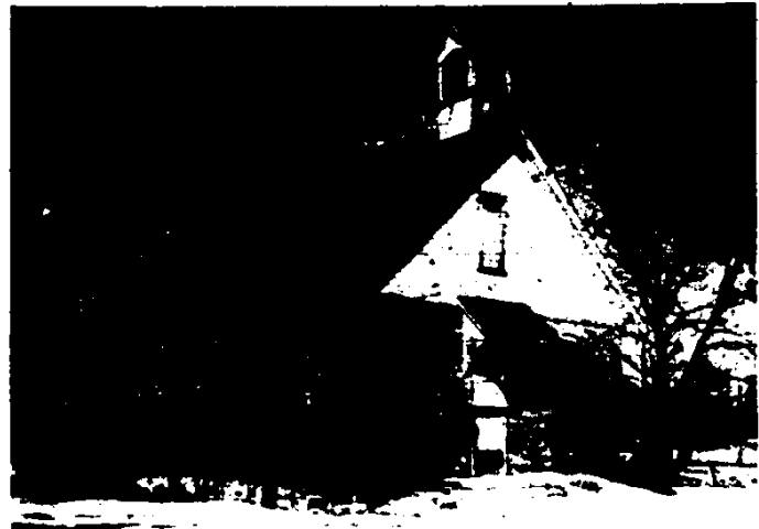
This one-room school building, build in the latter 1800s, is up for grabs...to families or nursery schools only.