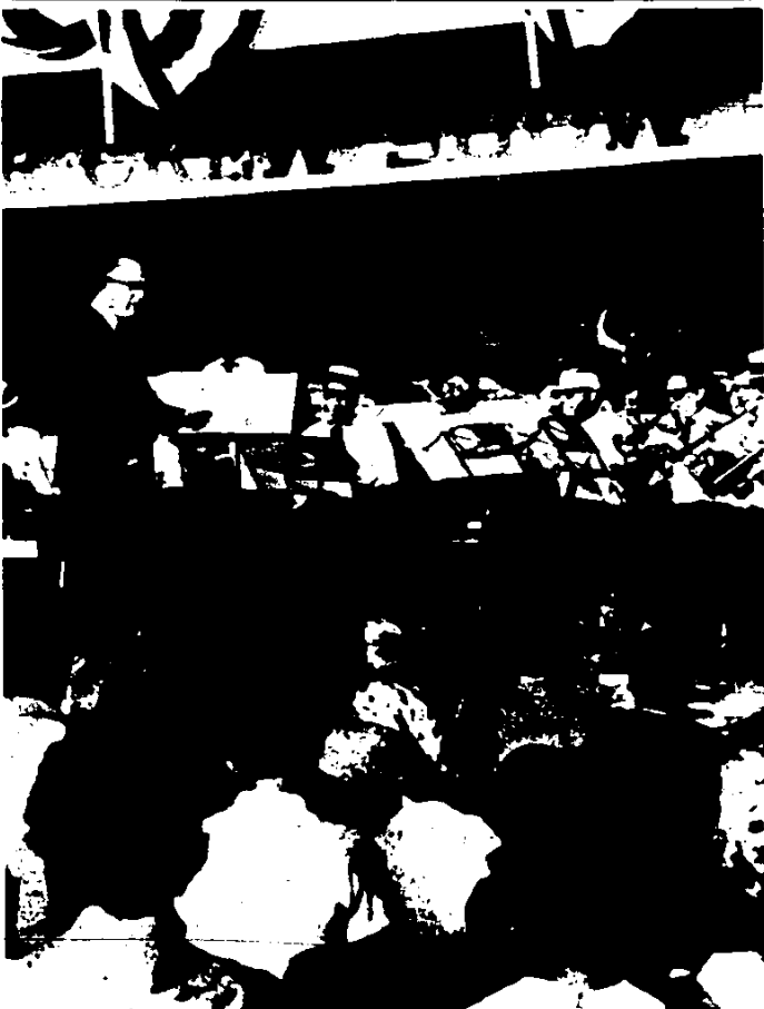
The Franklin Village Band, a consistent drawer of crowds at the Founders Festival, returns for a full hour concert Wednesday, July 23.