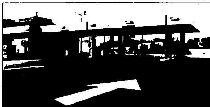
Four Drive-Up banking units plus a unique Drive-In Lane to an NBD 24-Hour Banker. All at the new NBD Drive-In Express at Grand River and Lakeway.

When you want to get in and out of a bank in a hurry, the fastest way is not to have to go into the bank in the first place.