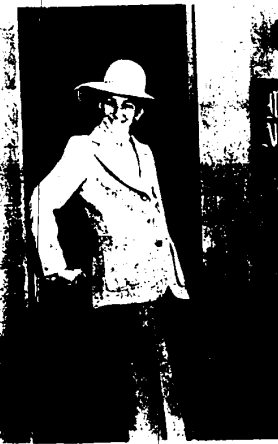
The classic blazer in Harris tweed from the Stanley Blacker collection.