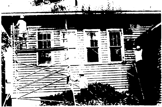
Pitching in to help renovate the new headquarters of the Farmington Area Advisory Council are these volunteers. Local businessmen and individuals contributed to spruce up the building.

Fun-filled dining is what we've got! A Charley's Crab is what we're not! So come on in and browse around! Roll up your sleeves for the best food in town!!! Chuck Meier LUNCH AND DINNER SEVEN DAYS 349-9220 41122 WEST 7 MILE NORTHVILLE, MICHIGAN AMERICAN EXPRESS HONOR CARD