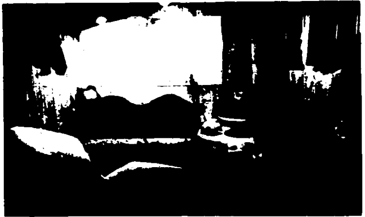
Leslie Masters' warm family room addition

90 Day Cash Option • 30 Day Lay Away • MasterCard Mon. Thru. & Fri. 10-9 • Tues. & Sat. 10-5:30 • Closed Wed. AUBURN at MOUND, UTICA • 731-7171