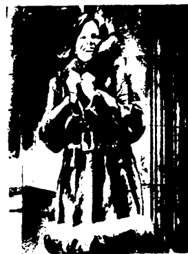
From our collection of muskrat coats. Bordered and collared in raccoon. Priced at $595