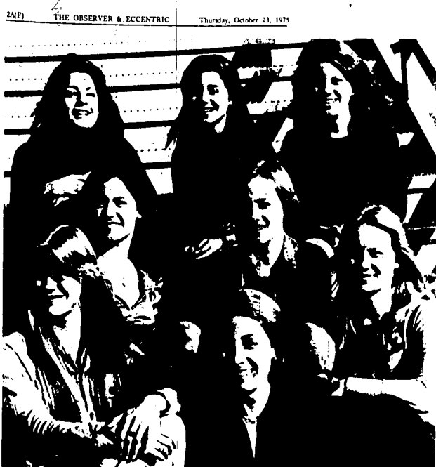
They compete for queen