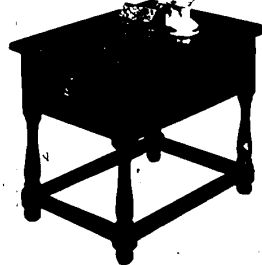
End Table (at Right) 28" Long x 22" high x 20" Wide

In a choice of Amber or Charcoal Pine finishes Limited Quantities