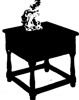
Lamp Table 24" x 24" x 22" High. Mfg. sugg. Retail $94.50