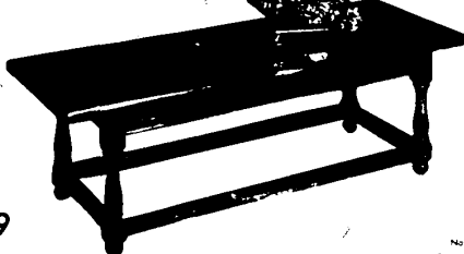
Cocktail Table 54" x 20" x 16 1/2" High Sugg. Price $94.50