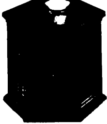
Hex Commode 25" x 25" x 21" 2 Doors Mfg. sugg. Retail $149.00