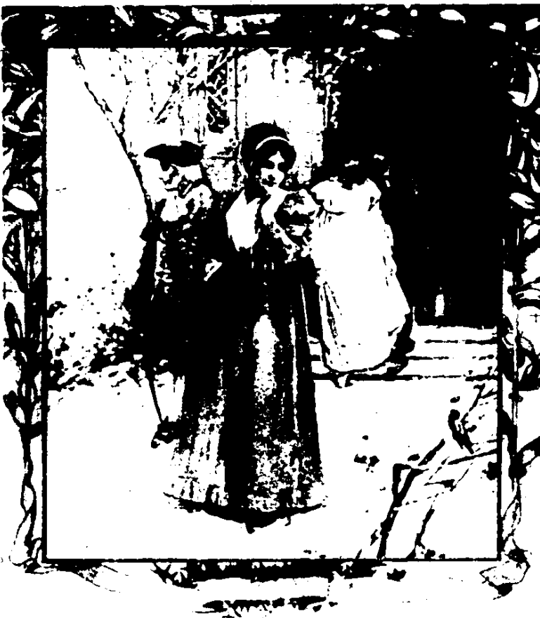
This card is a piece of fine art