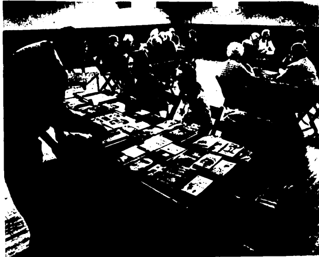
The Gathering Place, a senior resident drop-in center in the American Legion Hall, offers a variety of activities for seniors. Some like to