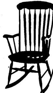
Boston Rocker (above) 41" high Antique Brown Maple Pine Decorated $75.00