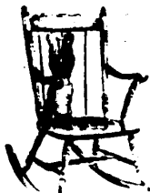
Bonister rocker Maple finish 36" high Special $65.00

STORE HOURS — NOW TIL CHRISTMAS: Mon. - Thurs. - Fri. 9 til 9, Tues. - Wed. - Sat. 9 til 5:30 Closed Sundays