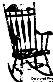
Decorated Pine Rocker Sale Price $99.00