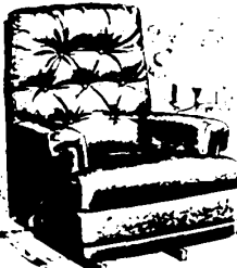
Barcalounger Rocker Recliner Covered in Rich Brown Vinyl Reversible Seat Cushions Reversible Seat Cushions Special $169.00