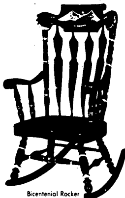
Bicentennial Rocker Pine Decorated 46" high 26" wide $109.00