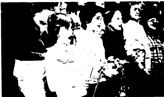
Young faces, young voices are an integral part of the celebration of Christmas.