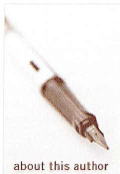
about this author