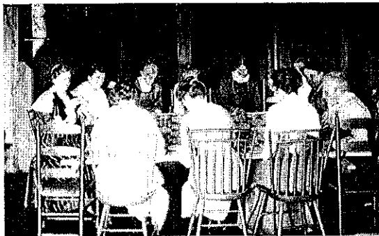
Quilting Party at Quillcote

Historically, women were not encouraged to pursue art seriously. So they incorporated their artistry in everyday works,