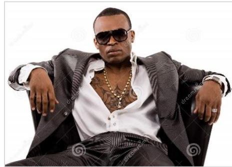
King (Iesha's boyfriend)