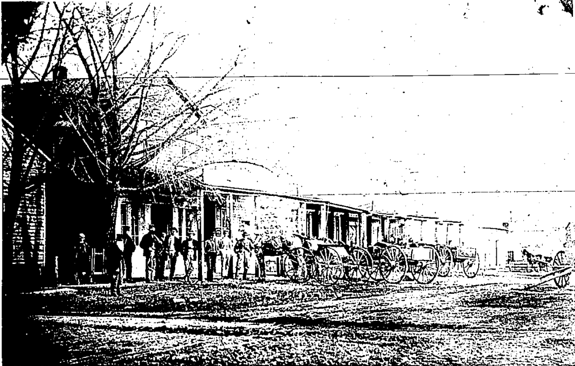
IN 1870, this is how the heart of downtown Farmington looked. This may be one of the oldest photographs of Farmington in existence. The second story of the stone building was the meeting place for the Masons when they first organized.