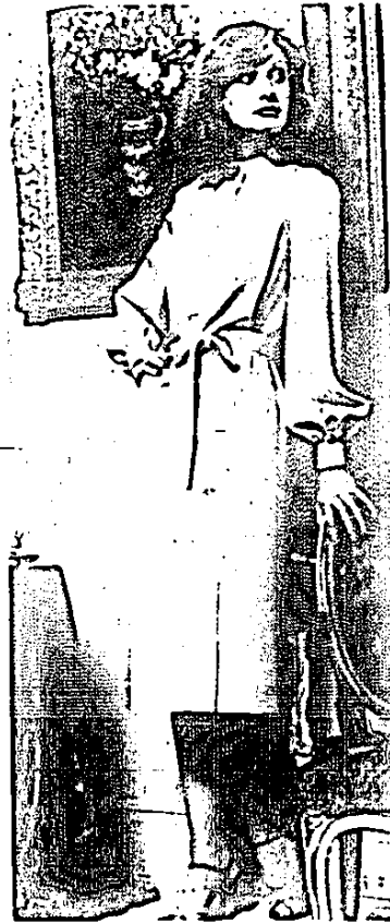
Crepe de chine for balmy spring evenings

To wrap up the whole package and put the seal on it, many trousseau items may be monogrammed. Usually the first initial of the husband's last name is used on silverware, glasses and table linen. The bride's monogram—the initials of her first, maiden and married names—can also grace the top sheets and silverware.