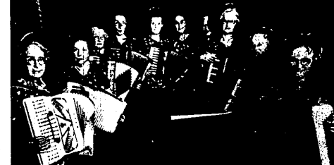
GRANNIES GUESTS — These are the Go-Go Grannies, all women past 60 who have learned to play the accordion in the last few months. They will entertain the Grand River Baptist Senior Citizens Club Dec. 19.

Reservations must be made at the church office by Wednesday, Dec. 17. The office phone number is 261-6950.