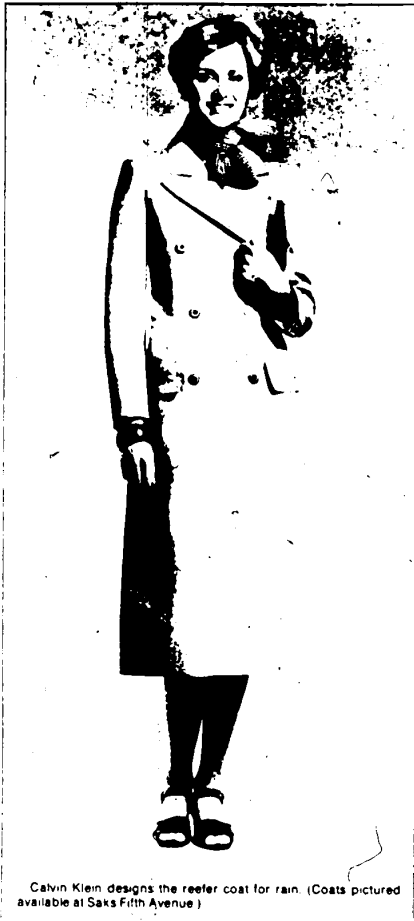
Calvin Klein designs the reeler coat for rain. (Coats pictured available at Saks Fifth Avenue)