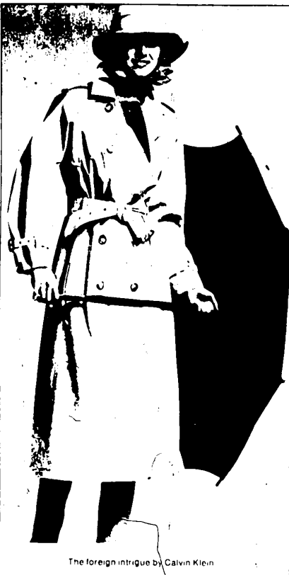
The foreign intrigue by Calvin Klein

Finally, if you can't stand putting anything at all on your head, the case for the umbrella is not to open and shut. The selections are so varied, from beige canvas with wooden accents to flowered versions that brighten even the darkest day, that you may have a hard time deciding. Whatever, get it all together and then, what else, pray for rain.