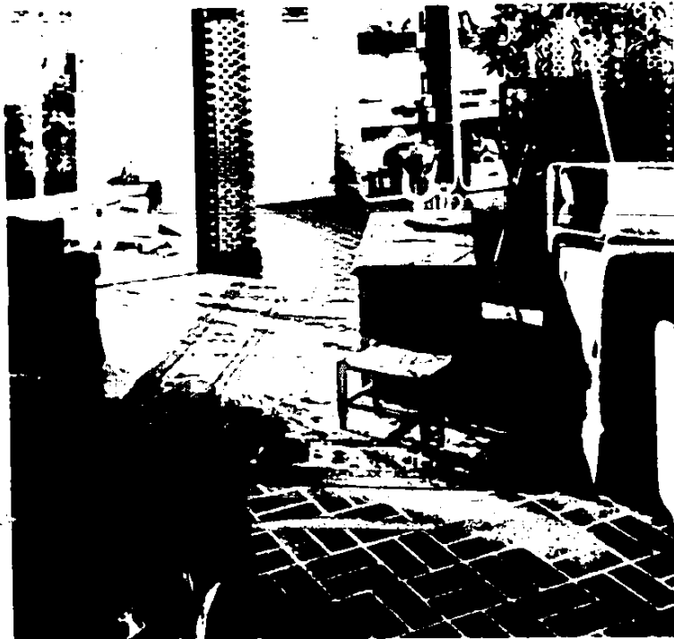
Preferred over wall-to-wall carpet for this upscale family room is an area rug over a vinyl brick floor. The denim fabric on sofa and chairs is good looking and long wearing.

In many cases broadloom is being replaced by area rugs over natural-look resilient floors, or just resilient