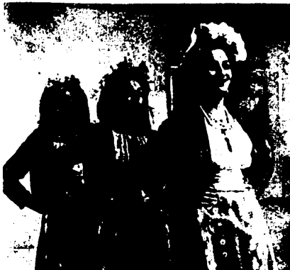
The dances of Kerkira performed by members of the Hellenic Society.

chapter, will be given an award by the Elks this week for his outstanding contribution to community services.