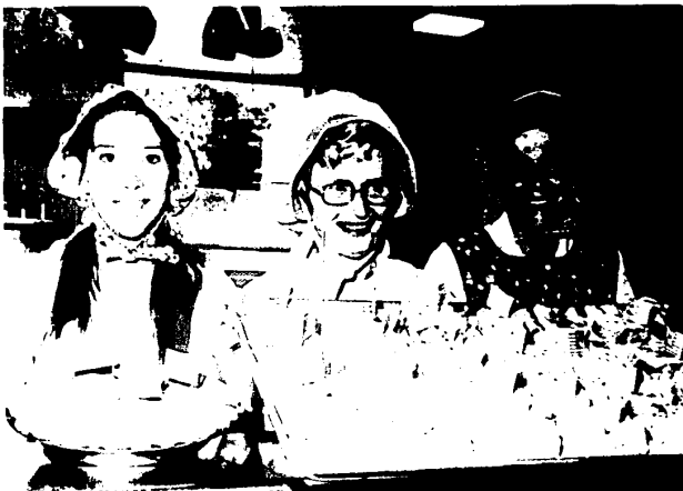
Meals fit for a patriot