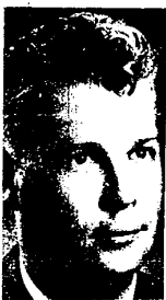
ADDRESSES GOP WOMEN...

Drivers under 25 years of age account for only one-fifth of America's drivers, but were involved in one-third of all fatal highway crashes in 1968, according to an annual report.