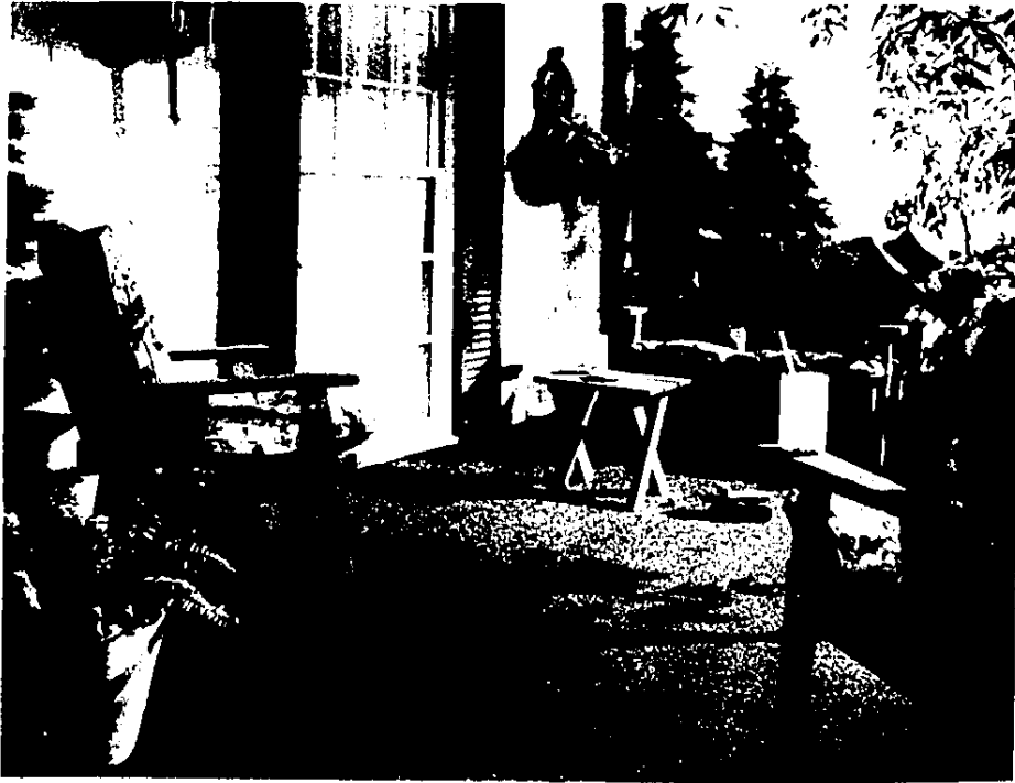
The "Ol' Sod" was never like this—fresh and green—impervious to sunlight and rain. Artificial grass products like this one by Armstrong are ideal for patio cover. Easy to install and care for, they enhance the setting in a colorful textured indoor-outdoor floorcovering.

Free instructions are available by writing Armstrong Cork Co., Lancaster, Pa. 17604, for CD-1024. The instructional sheet gives specifics for handling artificial grass when seams are involved and special precautions for a professional looking job.