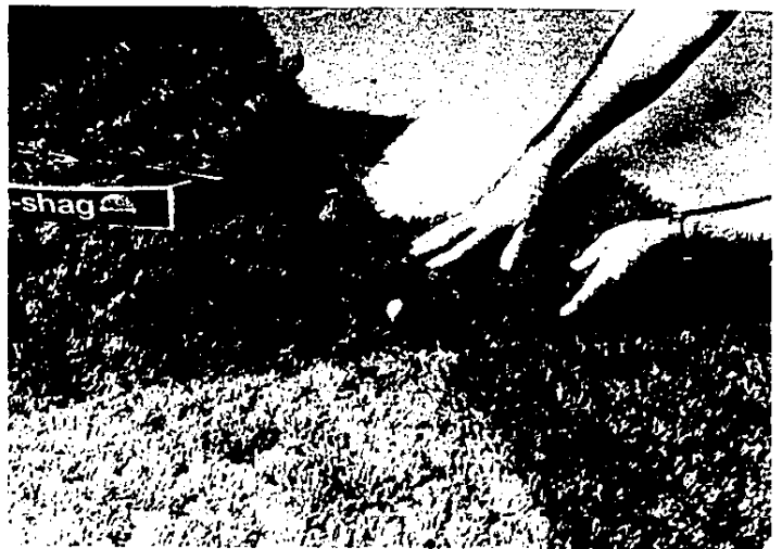
As easy as "place-and-press," Armstrong sculptured shag carpet squares offer the do-it-yourself easy installation with professional looking results. A combination of contrasting colors offers endless design possibilities.

If you want to separate, or just decorate—carpet squares can be the answer to do-it-yourself custom-carpet possibilities.