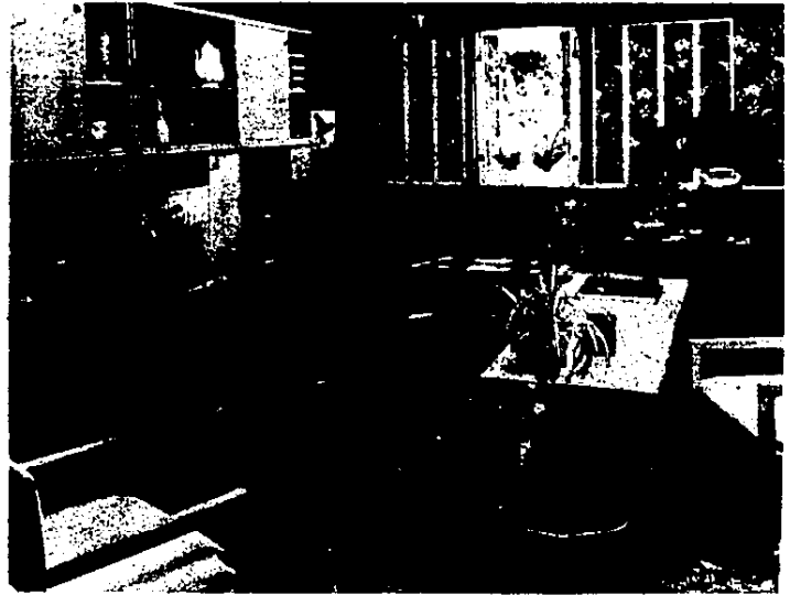
A multi-purpose room with wall-to-wall carpet in an "L" shape to separate the work/eat area from the rest of the room is created by using carpet squares. The 12-by-15-foot installation can be accomplished in only three hours.