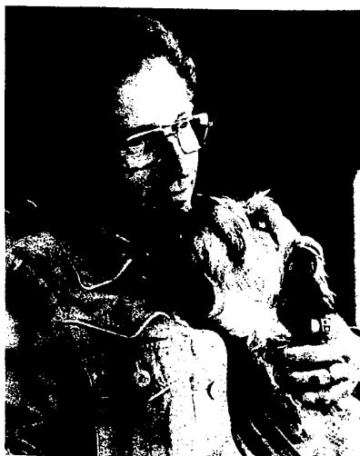
Joe Camp, who wrote, produced, and directed "For the Love of Benji," receives some encouragement from the star. The film opened Wednesday at area theaters.

cause I didn't think anything could top it," he said. But he was eventually talked into "For the Love of Benji," which was filmed on location in Greece.