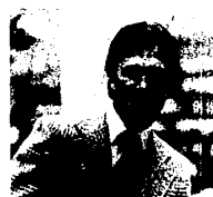
Today's well-groomed man can find a line of fine cosmetics just for him.

As man begins his venture into cosmetics, hoping for a smoother, younger-looking skin with a healthier color—women should prepare for a request for "a little more space for my skin care products, please."