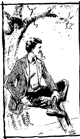
The Jordan Kahn Look for Fall

Classic elegance is appropriately conveyed by our Herringbone Sportcoat complete with bellows pockets and suede elbow patches, accessorized in uncommonly good taste with our scotch-ish wool crew neck and flannel slacks.