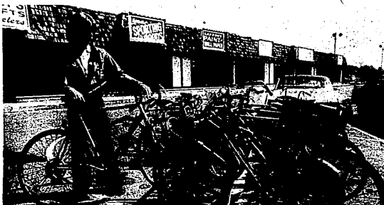
It's a fall line-up out back of the Farmington School Administration building, as buses get ready to roll (top). In spite of that line, a cluster of bikes waits with Mark Fanti, 17, to head back to school.