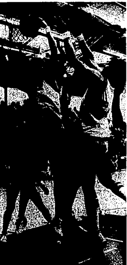
Two North Farmington players (white uniforms) battle for a rebound against Redford Union.