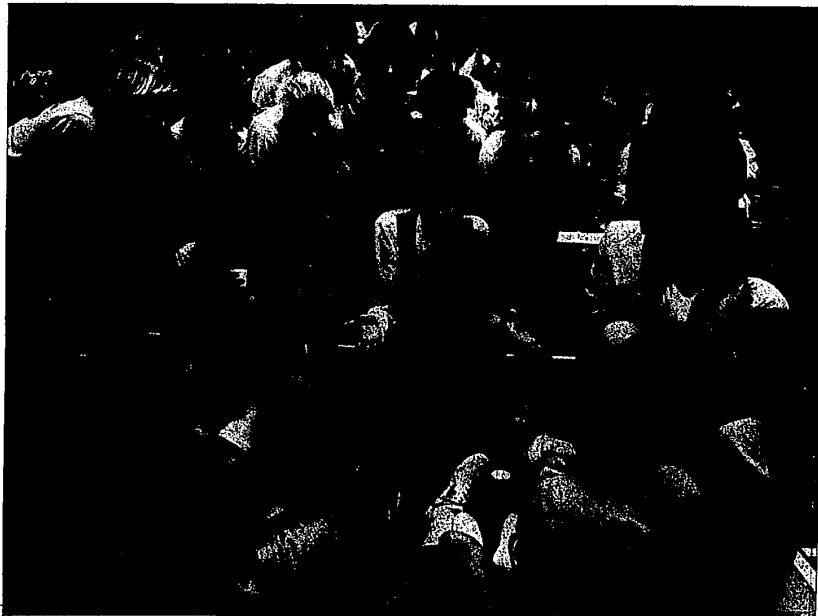
The important fourth quarter was a time when a coach's advice was heeded most (above). And the advice paid off. Mercy held on for a 63-52 victory, and for the first time, pointed their index fingers toward the sky and proclaimed themselves number one (right).